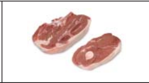
Shoulder Chops - Blade & Arm (Braise, Broil, Grill, Panbroil, Panfry)