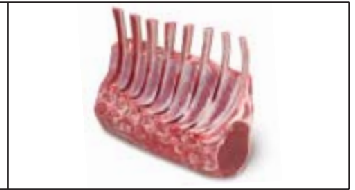
Frenched Rib Roast (Broil, Grill, Roast)