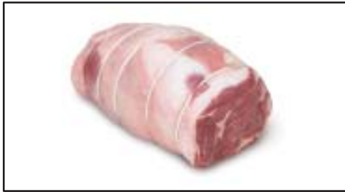
Boneless Shoulder Roast (BRT) (Braise, Roast)