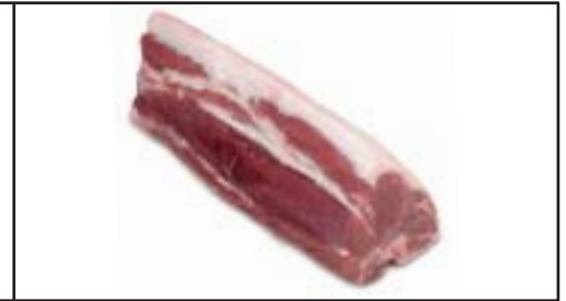
Loin Roast (Roast)