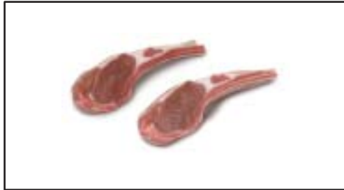
Rib Chops (Broil, Grill, Panbroil, Panfry, Roast)