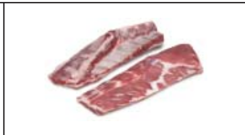
Spareribs (Denver Ribs) (Braise, Broil, Grill, Roast)