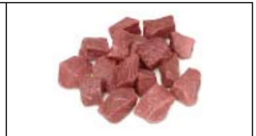
Lamb for Stew (Braise)

The above cuts are a partial representation of lamb cuts available.