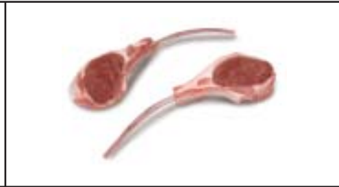
Rib Chops, Frenched, Special (Broil, Grill, Panbroil, Panfry, Roast)