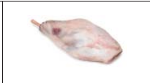
Frenched-Style Leg Roast (Roast)