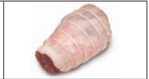
Boneless Leg Roast (BRT) (Roast)