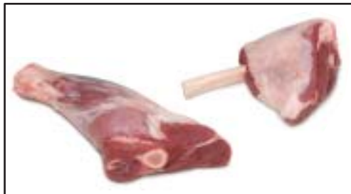
Shanks - Fore Shank & Frenched Hind Shank (Braise)